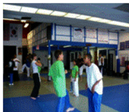
Kick-A-Thon June 2008